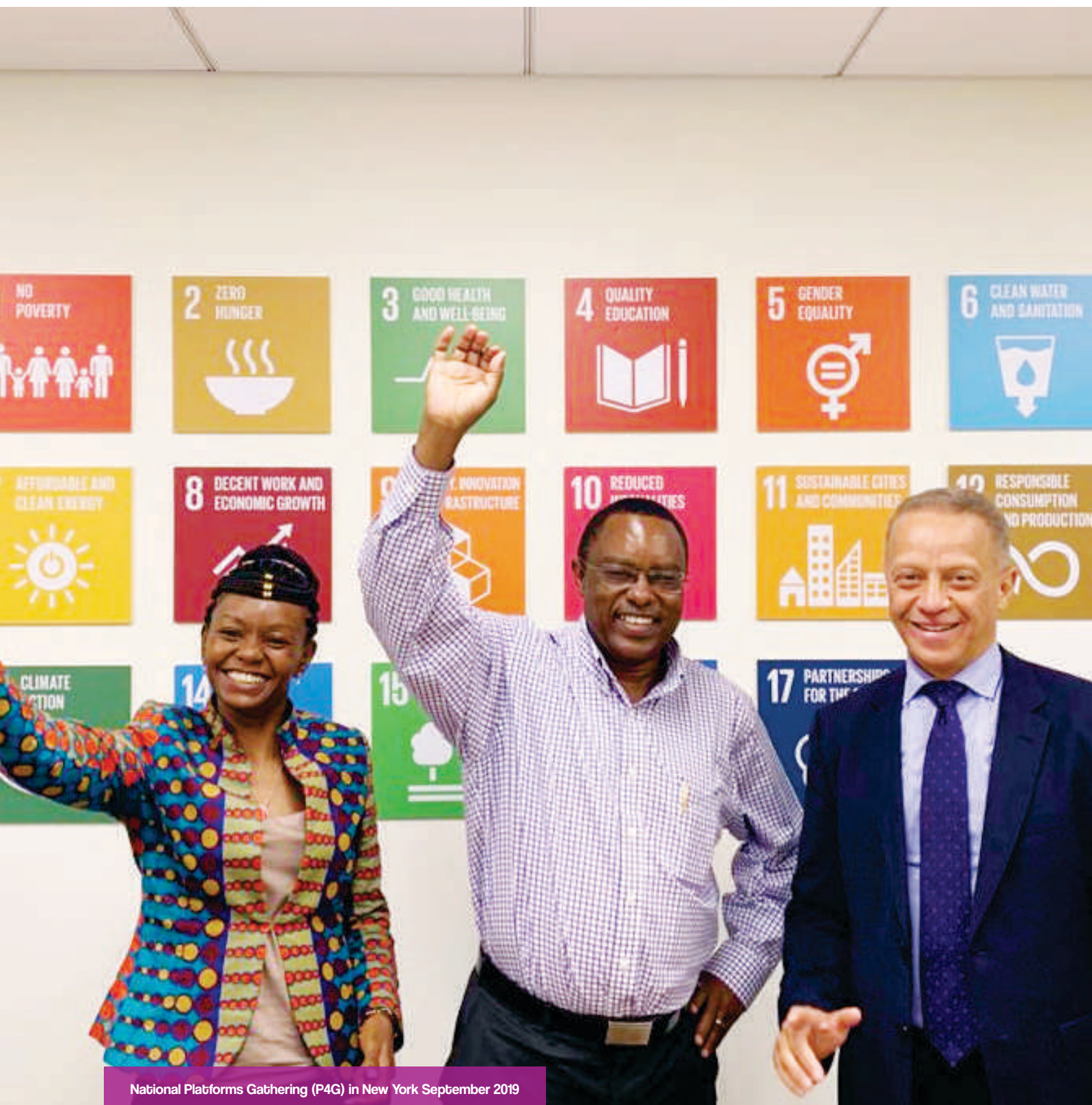
National Platforms Gathering (P4G) in New York September 2019