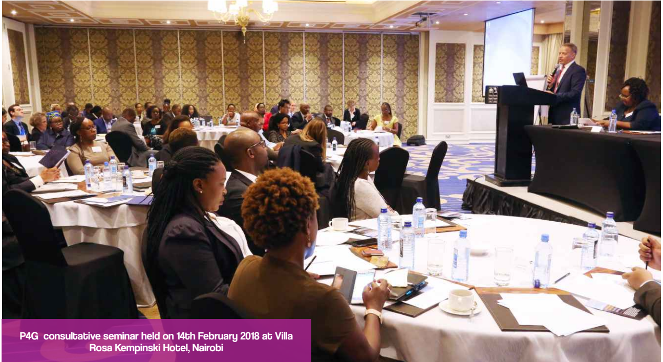
P4G consultative seminar held on 14th February 2018 at Villa Rosa Kempinski Hotel, Nairobi