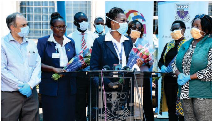
KEPSA's Flowers Of Hope Campaign Launch – March 30, 2020

The Kenya Private Sector Alliance conducted a several surveys to assess the impact of COVID 19 on Private sector in Kenya. During the April 2020 Survey, the spread of businesses that participated in the survey was : 29% were micro, 46% small, 16% medium and 9% large enterprises.